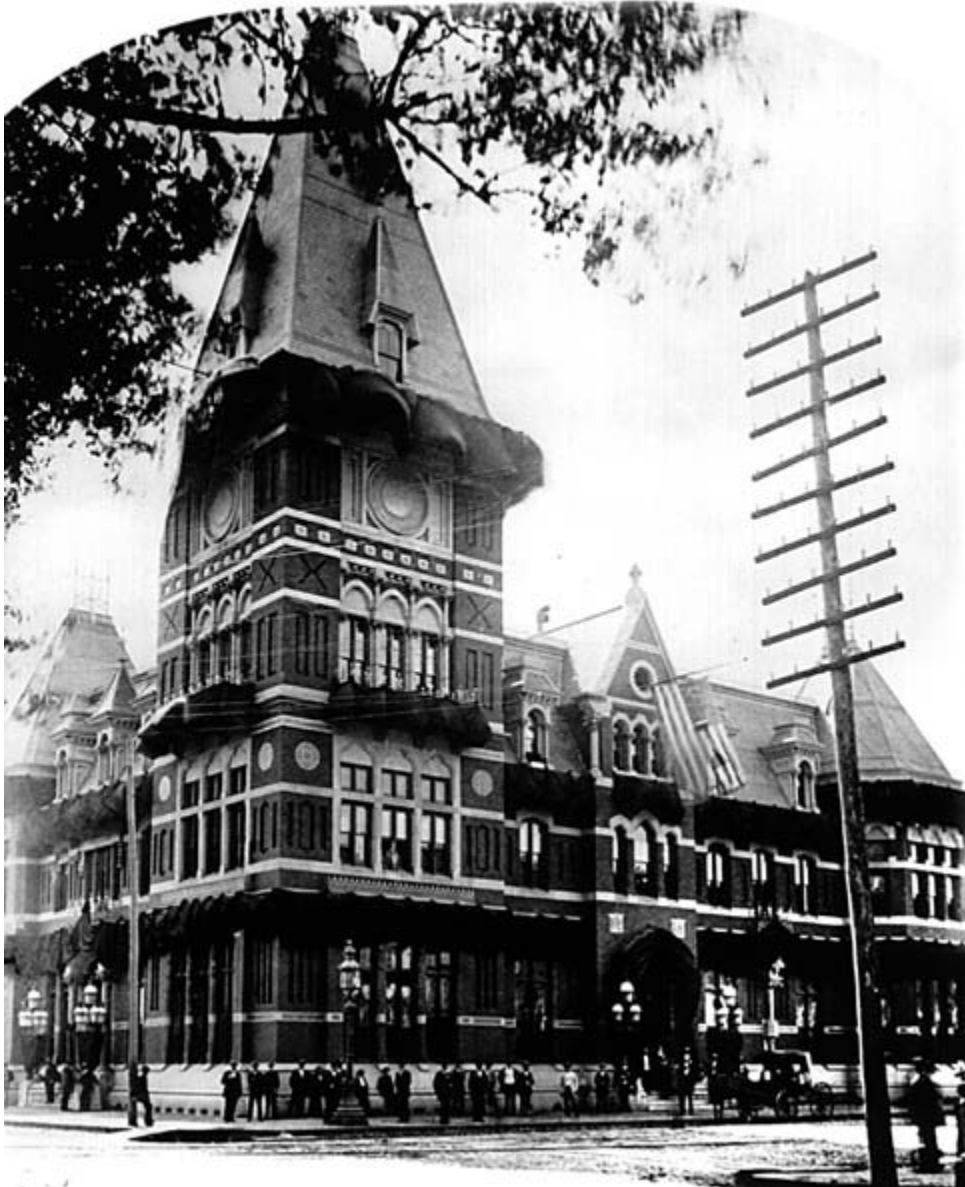
The Baltimore and Potomac railroad station, photograph