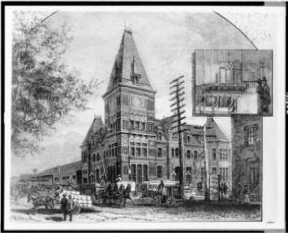
Baltimore and Potomac Rail Station Washington DC

http://www.pbs.org/wgbh/americanexperience/features/timeline/garfield/